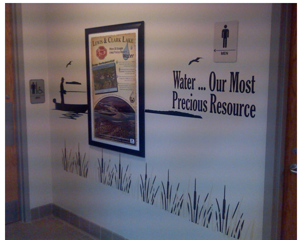
The new MSAC display at the Corps of Discovery Welcome Center receives many looks.

MSAC continues to explore ways to enhance Missouri River education available at the center which is just a couple of miles from Gavins Point Dam on Lewis and Clark Lake of the Missouri River.