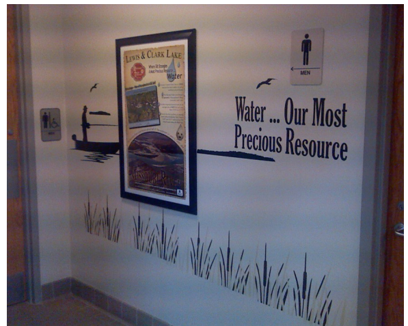
The new MSAC display at the Corps of Discovery Welcome Center receives many looks.

MSAC continues to explore ways to enhance Missouri River education available at the center which is just a couple of miles from Gavins Point Dam on Lewis and Clark Lake of the Missouri River.